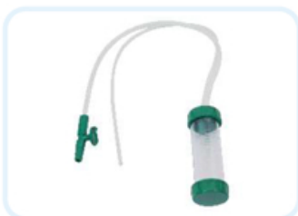
INFANT MUCUS EXTRACTOR