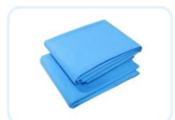
PLAIN DRAPE SHEET