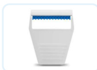
DISPOSABLE PREP RAZOR