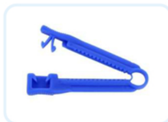
UMBILICAL CORD CLAMP